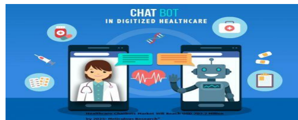
Figure 3: Medical Chatbots